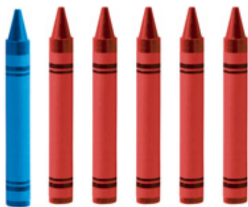
1 blue and 5 red

These students made 6 with red and blue crayons.